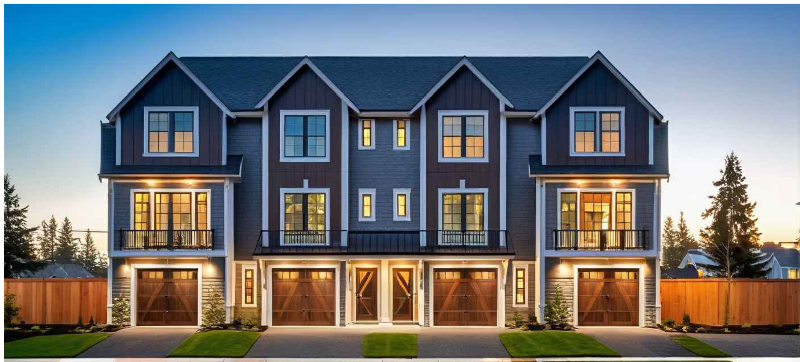
3-Story Front-Loaded Townhome - Example