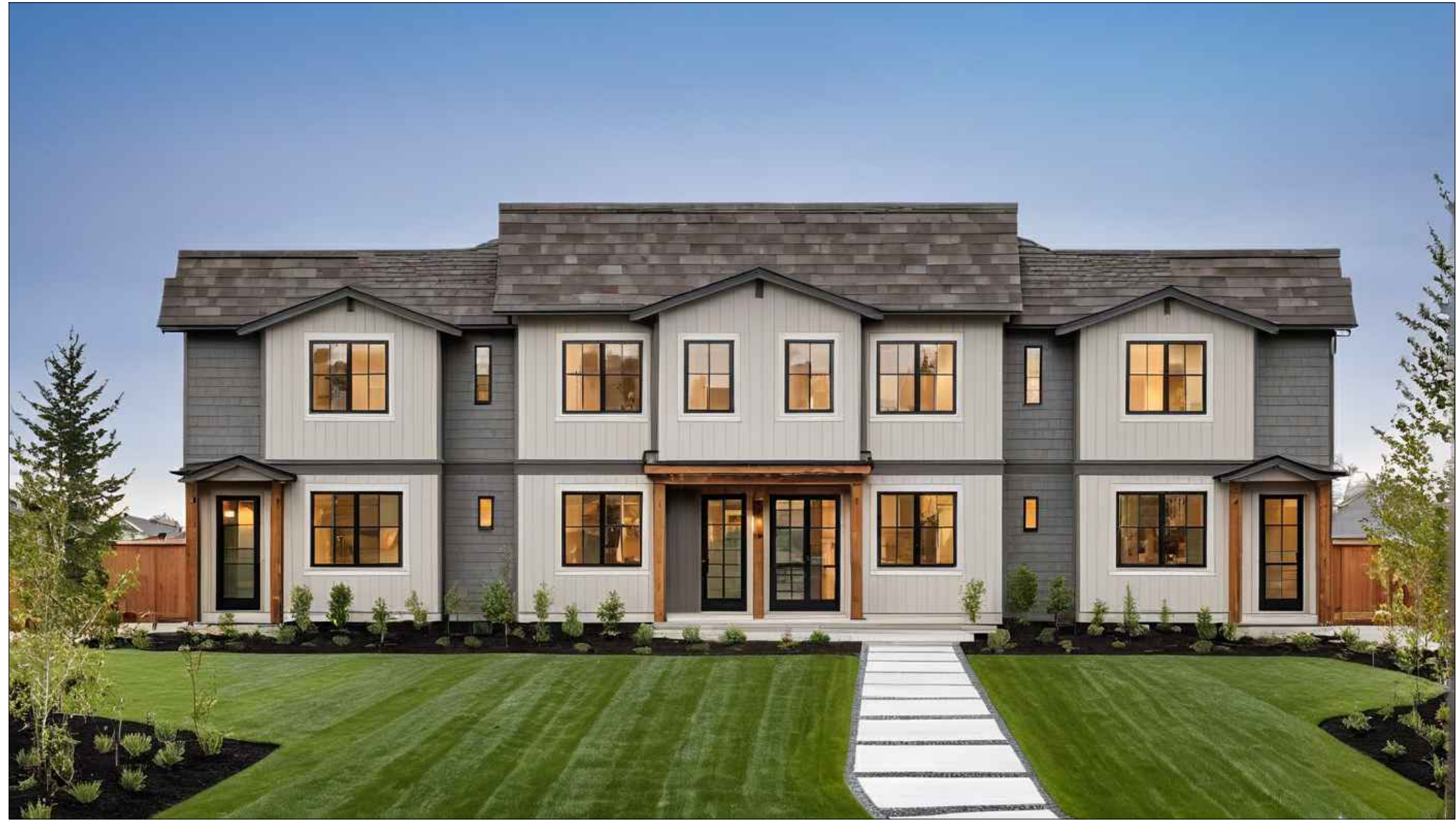
2-Story Townhome - Example