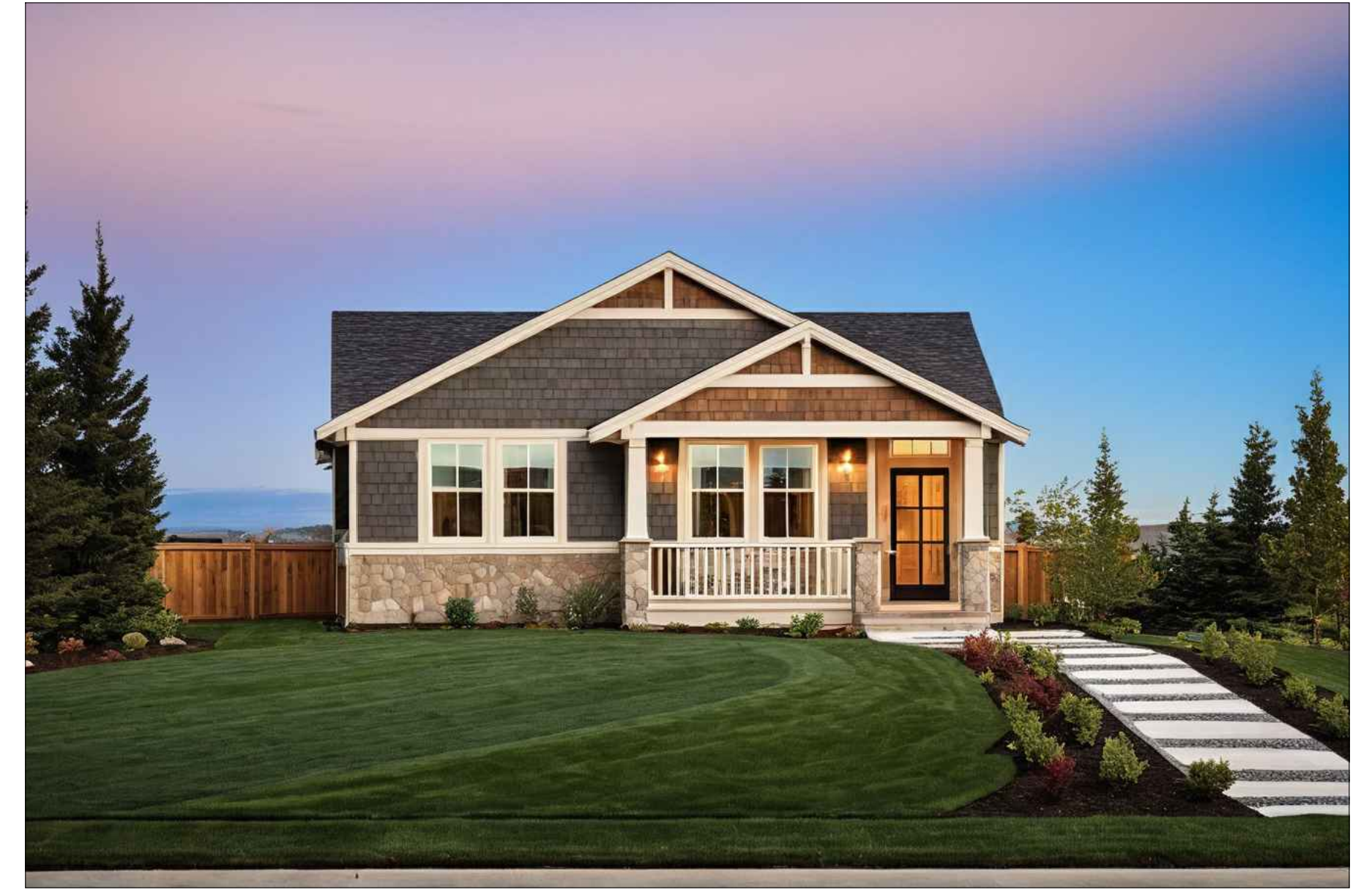
Single Story Cottage - Example A