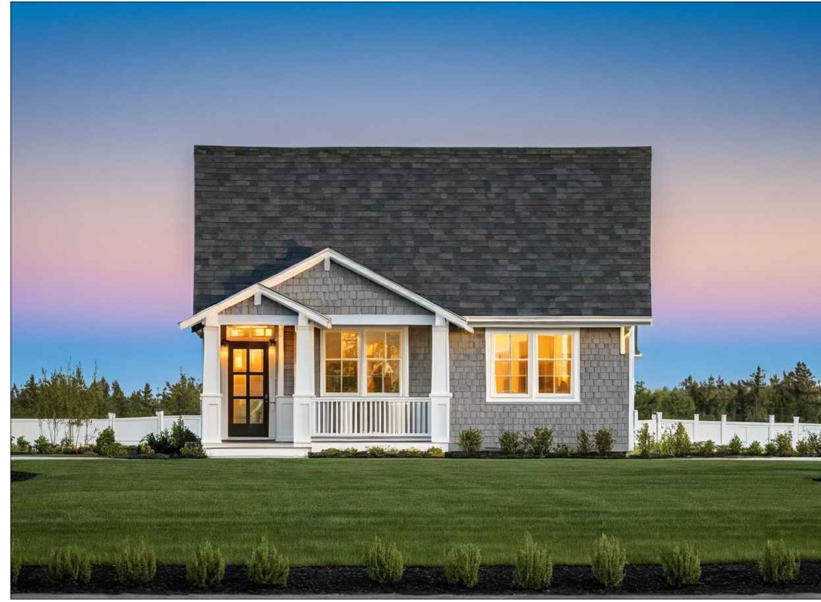
Single Story Cottage - Example B