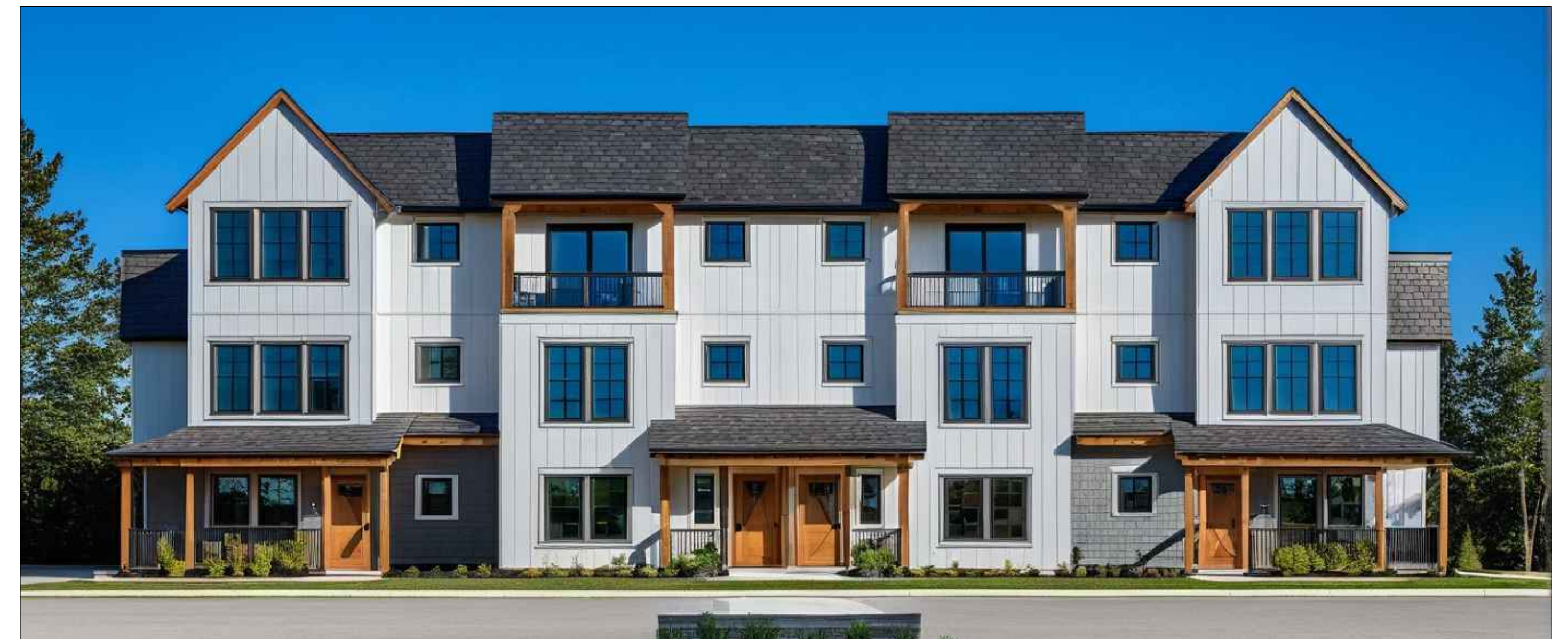
3-Story Alley-Loaded Townhome - Example